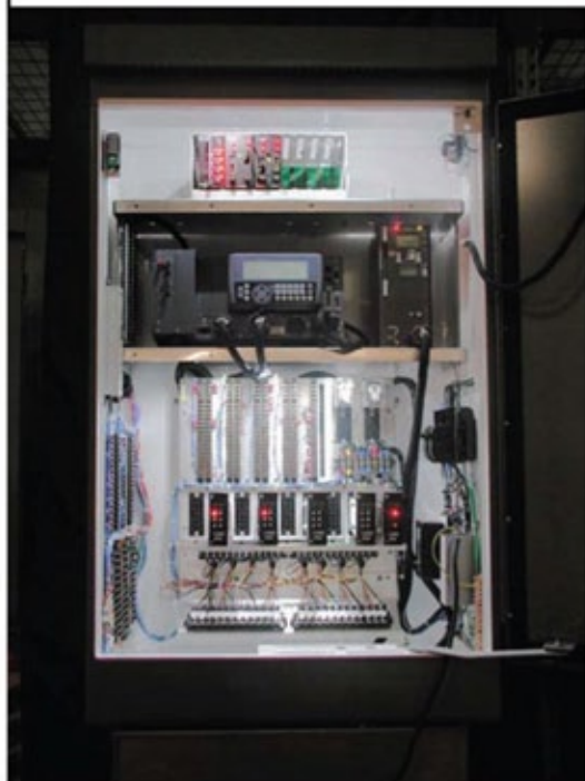
Relume Silver Circuit LED Technology

“See the difference in visibility between new Relume Silver Circuit LED Technology and incandescent light bulbs.”